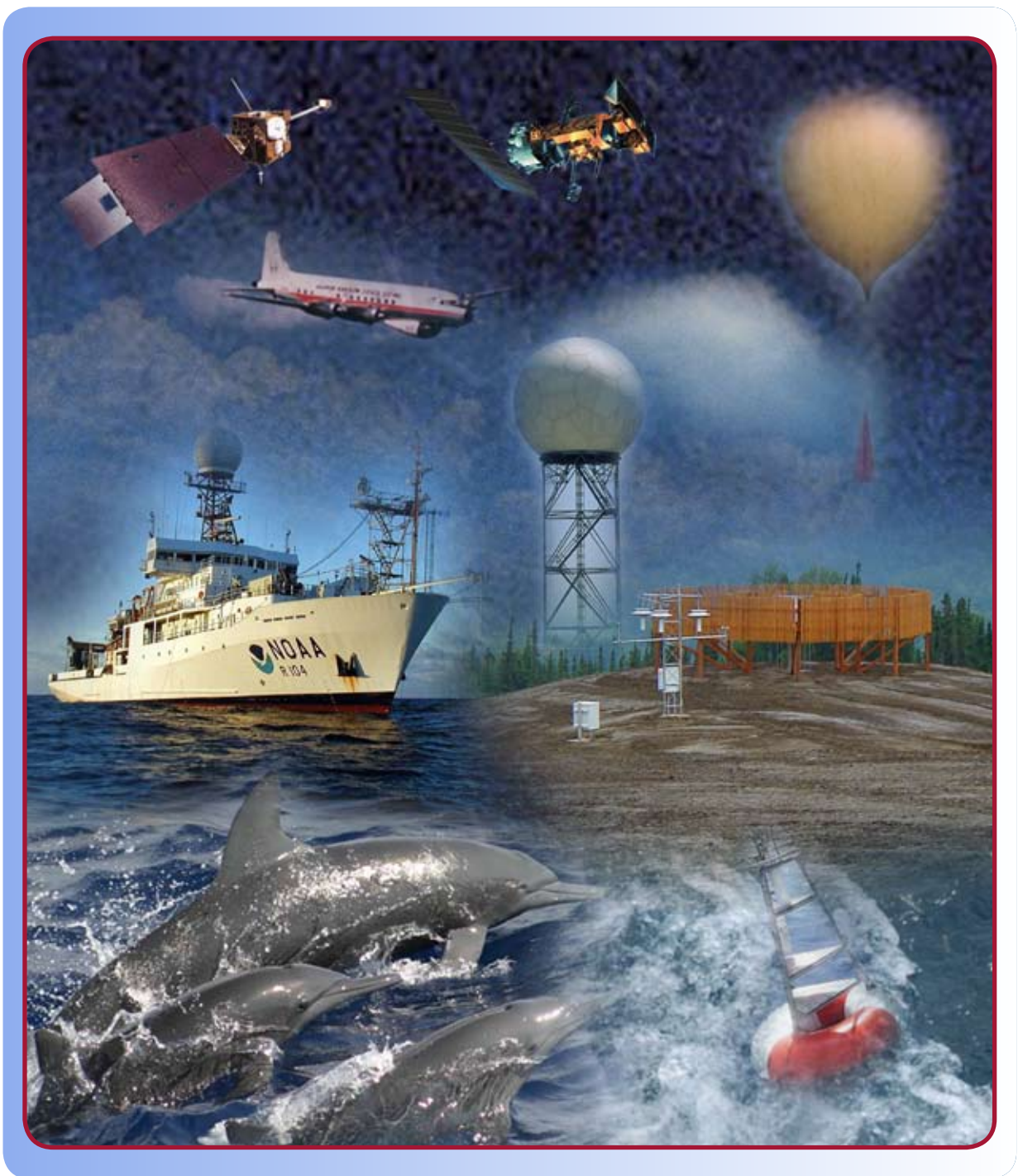
Artwork: Deborah B. Riddle, NOAA Special thanks to the NOAA Photo Library

The montage below depicts examples of observing systems that produce scientific records where this procedure would be used to determine what records are preserved in a NOAA archive.